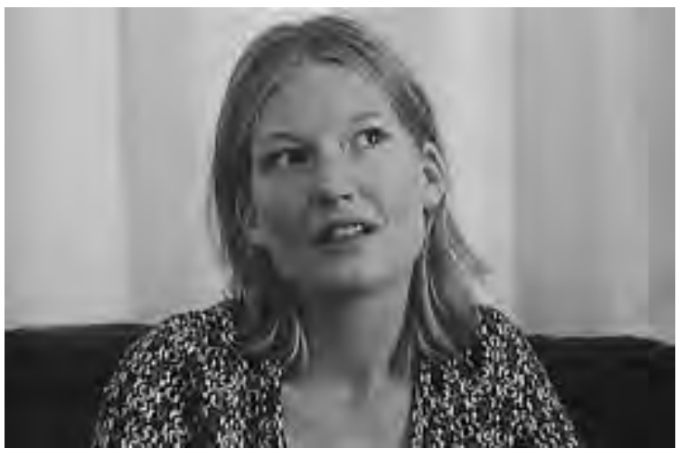
The Idiots (Dogme #2. Idioterne, Lars von Trier, 1998)

racters, the characters, the actors and von Trier himself. The film is also exposed with this mise en abyme , with cameras and microphones entering the frame with no attempt to hide them, since the aim is to make us conscious of the construction that the film necessarily entails, in which we participate as viewers. The Dogme 95 movement is also exposed through the metaphorical reading of the film, which invites us to consider the Dogme group as a collective willing to play the idiot in the film world or, if you will, to extol the virtues of idiotic (and thus authentic) cinema. And of course, we, as viewers, are also exposed, urged to be on the alert from the very beginning of the film when we discover, along with Karen in the taxi scene, that we are being teased and that things are not as they seem. Intermittently invited into the diegesis