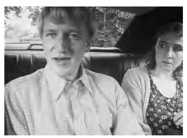
The Idiots (Dogme #2. Idioterne, Lars von Trier, 1998)

I will begin with a brief exploration of what I consider to be the most significant of the shifts that take place between levels 2 and 3 (i.e., between character and idiot-character). One of these is the orgy scene that unfolds in the house upon the suggestion of idiot-Stoffer. Jeppe and Josephine, two members of the group who, like the rest, are