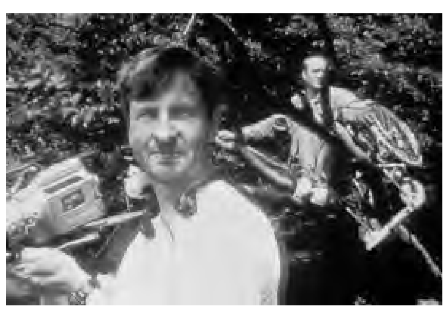
The Idiots (Dogme #2. Idioterne, Lars von Trier, 1998)

But neither the disabled aesthetics in which The Idiots immerses us nor this game with the viewer is based solely on the rules established by the Vow of Chastity. Before suggesting some answers to the four questions with which my analysis began, it is important to note one last formal aspect of the film which, although not reflected in the Vow, is highly relevant to this discussion: the con-