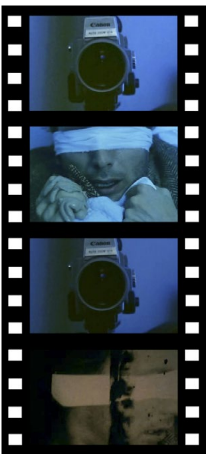
Figure 1. Vampirism process in Rapture (Arrebato, Iván Zulueta, 1979)

trade, perceive it as a way of life, and show this through constant study of their medium of expression. The purpose of this article is to explore how these filmmakers think about filmmaking by making films.