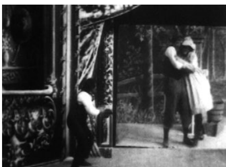
Figure 2. Reflexivity in early films

Edwin S. Porter's 1902 film Uncle Josh at the Moving Picture Show [Figure 2].