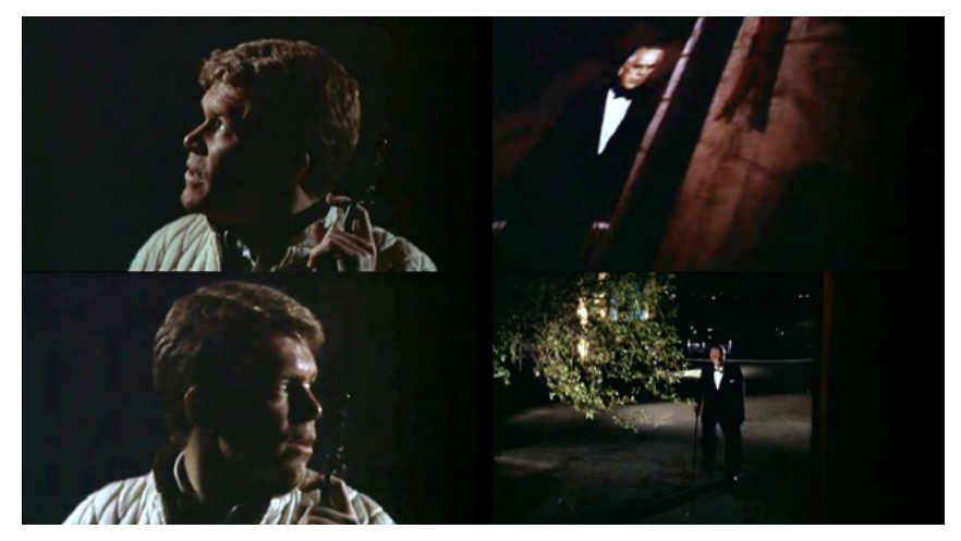
Figure 9. Transfictional raccords in Targets (Peter Bogdanovich, 1968)

This type of raccord can also be useful for explaining other types of relexivity, such as that found in the film Dead Men Don't Wear Plaid (Carl Reiner, 1982), a film which, both for its aesthetics and for its plot, as well