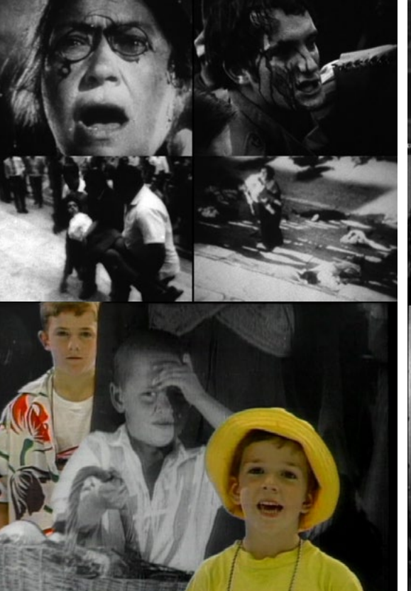
Left, top. Figure 6. Odessa and The Base of the Air is Red (Le fond de l'air est rouge, Chris Marker, 1977) Left, bottom. Figure 7. Steps (Zbigniew Rybczyński, 1987) in Odessa Right. Figure 8. Sherlock Jr. (Buster Keaton, 1924)

logue with a film screen is taken up again later by Woody Allen in his film The Purple Rose of Cairo (1985). Here, the one who crosses through the screen is not the protagonist of the main plot, Celia (Mia Farrow), but one of the characters in the film on the screen. Both Celia and the projectionist in Keaton's film are humble people who find in cinema a means of escape; in the first case, a way out of her humdrum life, and in the second, a solution to his problems. In essence, Sherlock Jr. and The Purple Rose of Cairo can be considered paradigmatic examples of this category which, as Xosé Nogueira (1994:48)