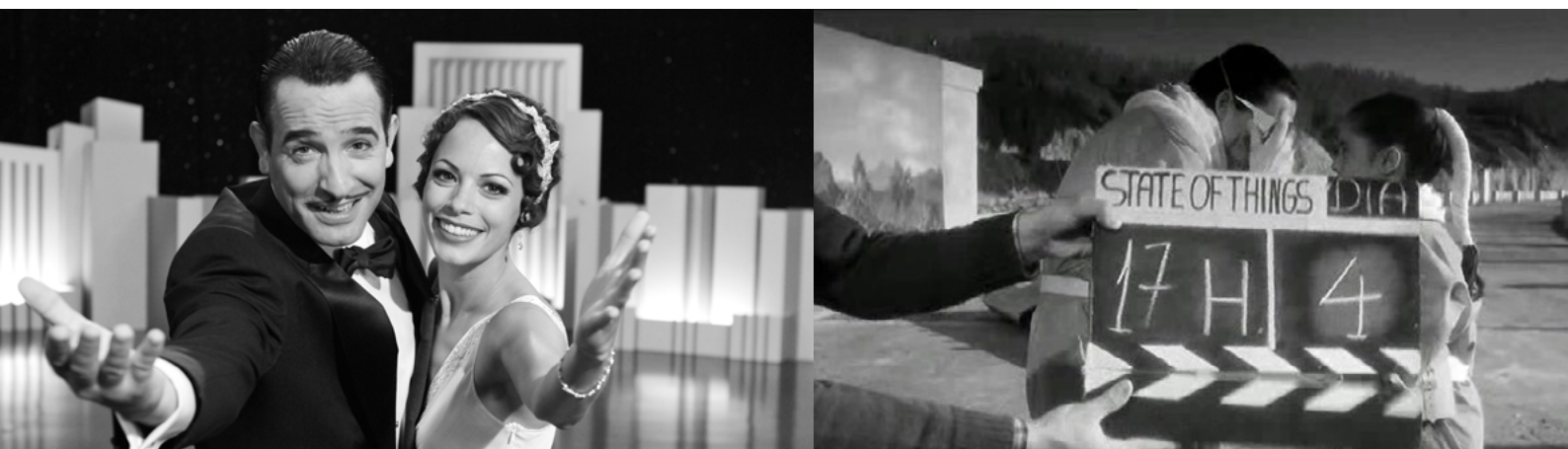
Left. Figure 4. The triunphant dance in The Artist (Michel Hazanavicius, 2011) Right. Figure 5. The State of Things (Der Stand der Dinge, Wim Wenders, 1982)

Clearly, the difficulty associated with pursuing a risky project that doesn't conform to the standardised formulae is another constant that defines this type of film. Another example is the 1996 film Irma Vep by Oliver Assayas. In this case, the project, unfeasible from a commercial perspective, is a remake of Les vampires, a French silent cult series filmed by Louis Feuillade in 1915. In Contempt (Le mépris, 1963), Godard offers another example of this constant; specifically, the impossible task of adapting Homer's Odyssey within the usual parameters of film production<sup>5</sup>. Nor is it easy to adapt the com-