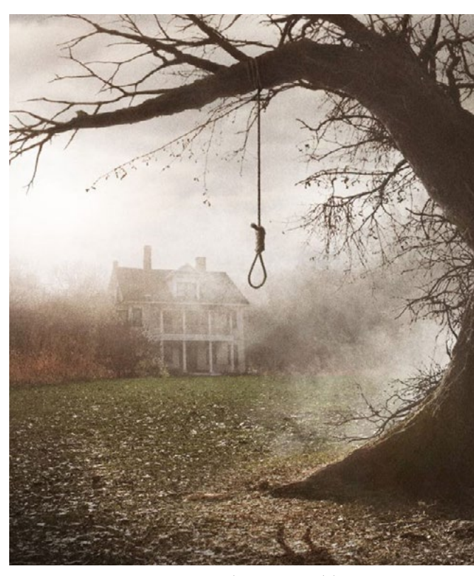
Figure 11. More horror with The Conjuring (James Wan, 2013)

Carroll, Noël (1982). The Future of Allusion: Hollywood in the Seventies (And beyond). October , 20 (Spring), 51-81.