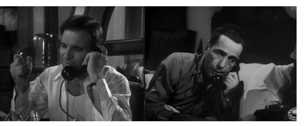
Figure 10. Reardon needs Marlowe's help

sets the text in relationship, whether obvious or concealed, with other texts" (Genetie, 1997: 1). He then proposes a classification in order to better define this idea, outlining five categories, including "architextuality", which serves to define the adherence of a text to a genre.