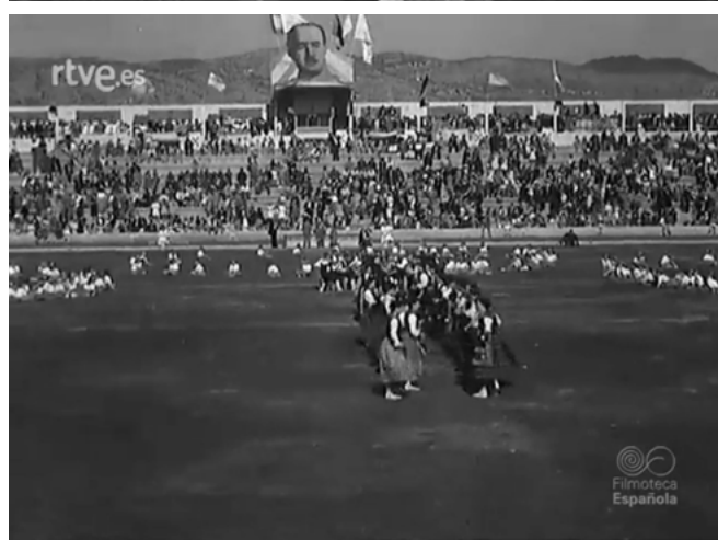
From top to bottom. Figure 6. Third National Gymnastics Championships held at University City of Madrid (NO-DO, 17A, 1943). Figure 7. Dance presentations at a rural gymnastics event (NO-DO, 76A, 1944). Figure 8. Coros y Danzas presentation at the Castellón Gymnastics Festival (NO-DO, 253B, 1947)

the winners. On the other hand, Newsreel 253B (1947) ends with what almost seems like a mistake: a close-up shot of a participant receiving a bouquet of flowers and a trophy, although the image quickly fades to black. Moreover, in this last newsreel (the analysis of which is hampered by the fact that the audio track has been lost), the sporting display is presented as a festival with a markedly traditional tone and practically half the footage is dedicated to the Coros y Danzas , Spanish folk singers and dancers shown performing in a wide shot under the vicarious gaze of Franco, whose face appears on a large poster positioned high above them (Figure 8).