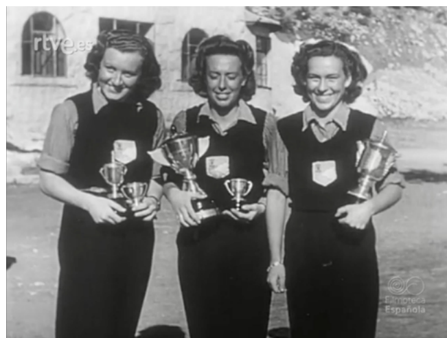
Figure 5. Trophy ceremony in the newsreel on the Sección Femenina de Falange skiing championship (NO-DO 66B, 1944)

The three news stories included in NO-DO about the various gymnastics events similarly reflect the limits imposed on the public display of the genuinely Spanish female body. The structure of all three is practically identical: all include long shots of the event (Figure 6) and of the traditional dance performances (Figure 7), which, as we are told in Newsreel 76A (1944), "also form part of the program of these exercises" along with previous "flexibility" and "balance" exercises. The news story about the Third Gymnastics Championships (17A, 1943) does include the trophy ceremony, although it only shows the Falange leaders, never