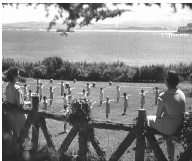
Figures 2 and 3. Still-frames from the newsreel "Santander: Organizaciones Juveniles" ( El Noticiario Español , No. 7, 1938)

This idea of emancipation is also evident, although less explicitly, in the film footage of this "physical culture" course, as it is named in the voice-over. The cameras of the DNC linger on its most expressive aspects, the open-air gymnastics exercises whose harmony is highlighted in two shots: one wide shot showing two girls sitting in the foreground watching the movements of the group with the sea in the background; and a slightly angled shot showing the women with a building reminiscent of Greco-Roman—but also fascist—architecture behind them (Figures 2 and 3). The girls are dressed in light coveralls ending just above the knees and tied in at the waist, and the voice-over highlights the importance of ex-