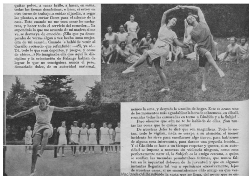
Figure 1. Photographs accompanying the article "Carta de una cursillista" by Lula de Lara, published in Y magazine (No. 6-7, 1938)

Something wonderful that absolutely every woman should learn and engage in. There is nothing lovelier, in the hours we dedicate to games, gymnastics and sports, than seeing a group of girls—there are just over thirty of us—on the field, dressed in short, bright coveralls, their young bodies standing proudly and attentively to the grace of the movements [...]. And all the girls [...] get to learn about the supreme beauty of physical action, of the trained and flexible figure, charm and the science of the posture (Lula, 1938: 54).